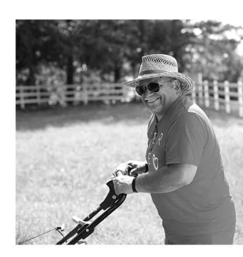
See the need, be the answer.

Whether it's here in our community, across this nation in the backwoods of Wisconsin or across the globe in the jungle of Cambodia, go and announce. I want to invite you to join me in praying that our mindsets would be shifted to just that: a mindset that desires to proactively go and announce. I believe if we follow His command we will be highly effective in growing the Kingdom of God.